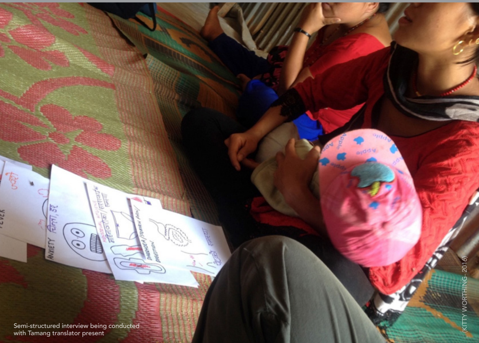
Semi-structured interview being conducted with Tamang translator present